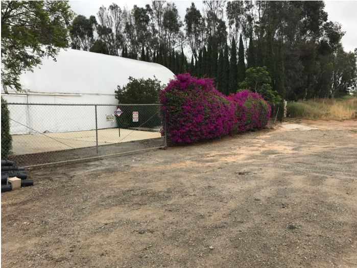
501 Osborne Main South Entrance