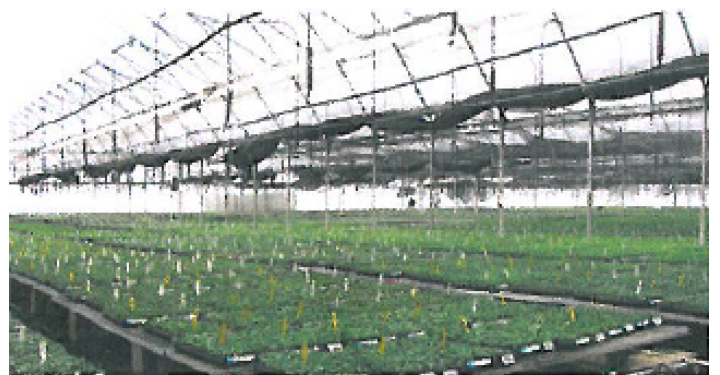
501 Osborne Production 1A