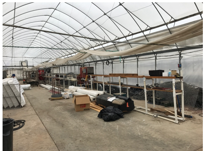
501 Osborne Head House