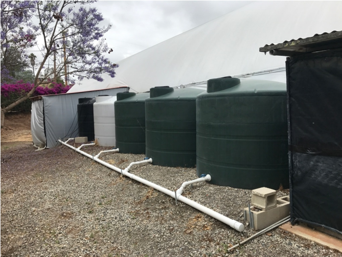
501 Osborne RO Reservoirs