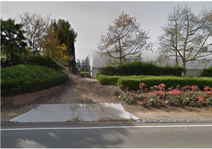
501 Osborne North Entrance