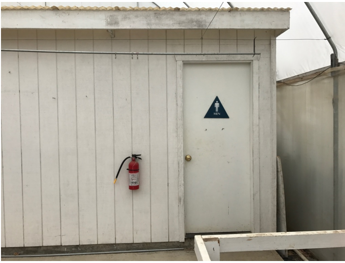
501 Osborne M and W Bathrooms